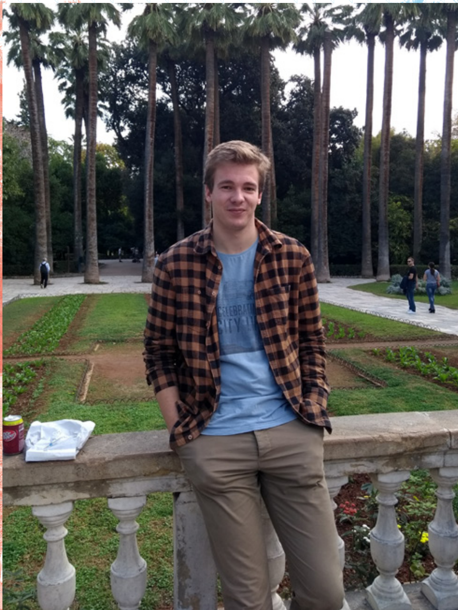
Sebastian Schimper (private archive)