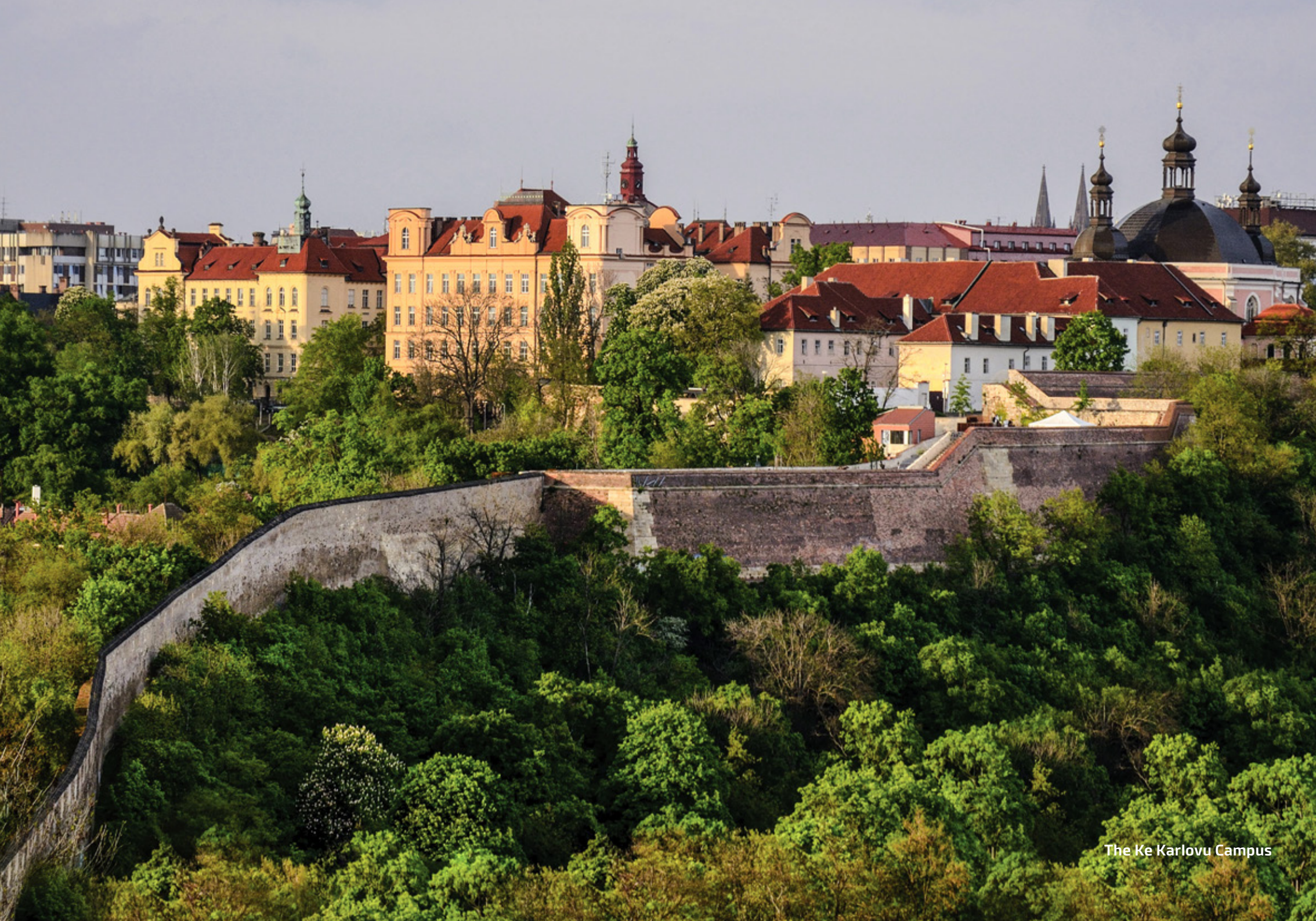
The Ke Karlovu Campus