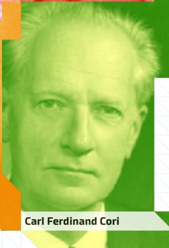
Carl Ferdinand Cori